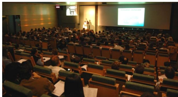
View of the congress hall