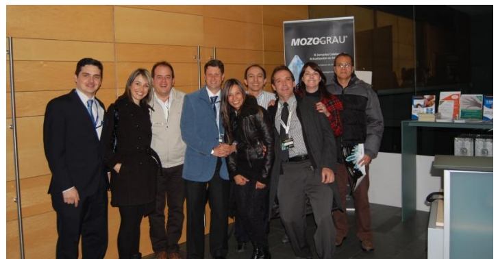
Group of doctors from Colombia at the congress entrance