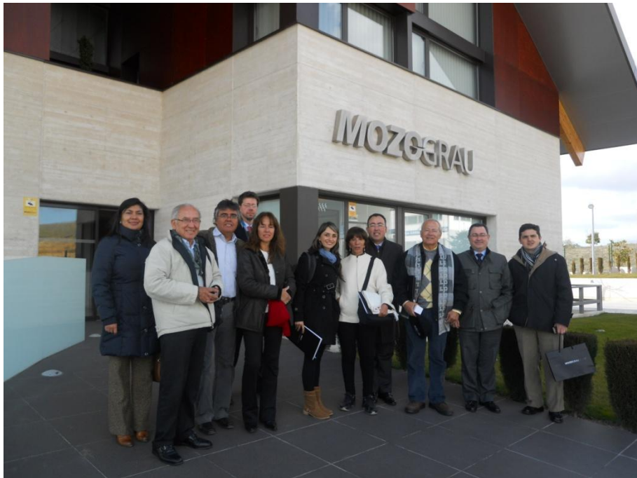
Group of doctors from Chile at Mozo-Grau premises