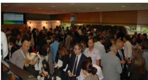
View of the coffee break