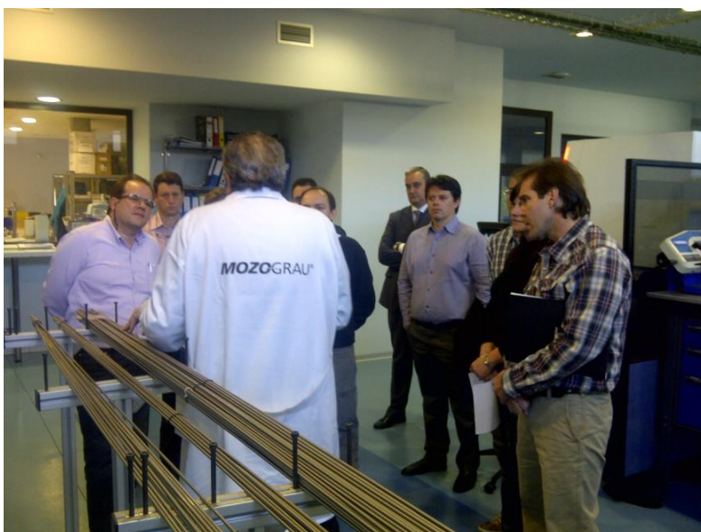
Group of doctors from Colombia at Mozo-Grau facilities