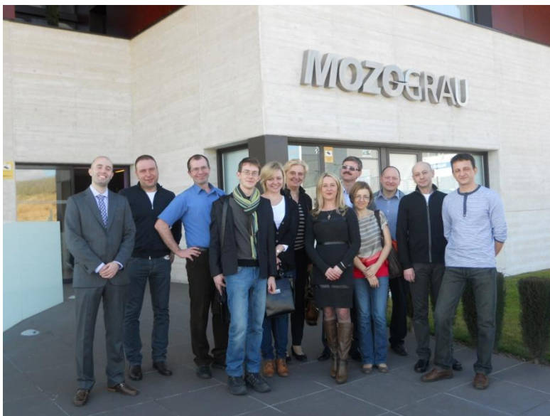
Group of doctors from Poland at Mozo-Grau premises

As part of the III Mozo Grau Catalan Implantology Symposium organized by Mozo-Grau, groups of doctors from Colombia, Chile and Poland visited our premises in Valladolid to gain deep knowledge of Mozo-Grau manufacturing and Quality Control Systems.